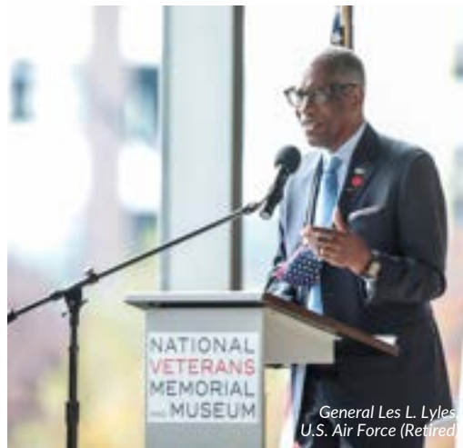
General Les L. Lyles U.S. Air Force (Retired)