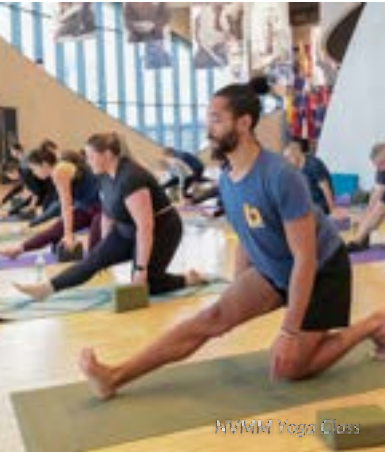
NVMM Yoga Class