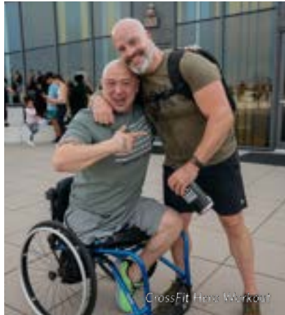
CrossFit Hero Workout