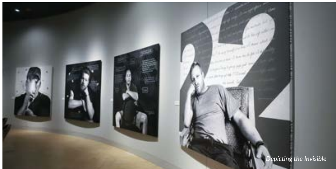
Depicting the Invisible