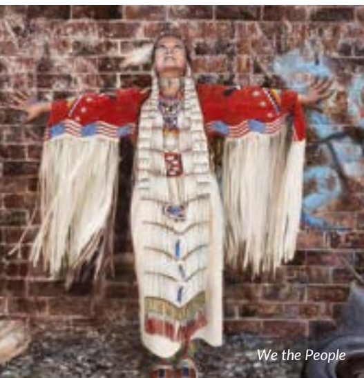
We the People