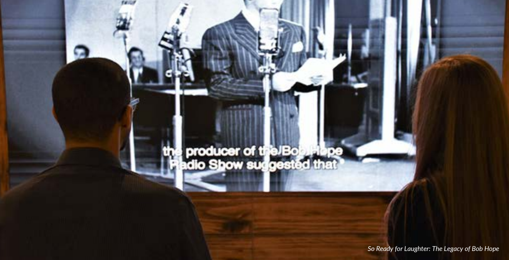
So Ready for Laughter: The Legacy of Bob Hope