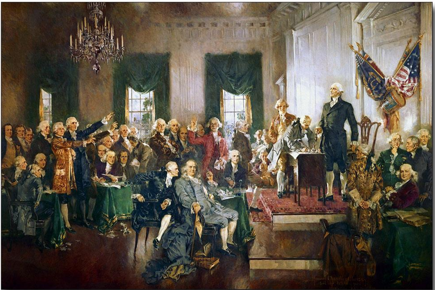
Howard Chandler Christy Signing of the United States Constitution Oil on Canvas 20' x 30' 1940 U.S. Capitol, House Wing, East stairway